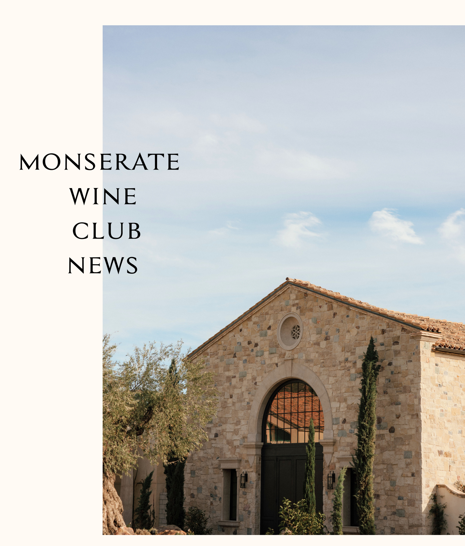
February 2025 - May 2025